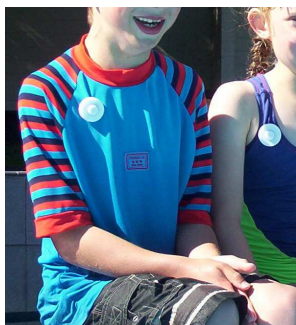
Figure 1. UV monitor attached to the lapel

Primary and Intermediate schools were randomly selected from five geographically different regions of NZ. Two groups of students were identified based on age groups used in similar studies (Wright and Reeder, 2005). Students in Year 4 (Y4) and Year 8 (Y8) were selected since these two age groups provided a suitable variation in children's behaviour while attending different year levels in the NZ school system. Consenting students were asked to wear a UV monitor and fill in an activity diary for one week during the fieldwork period between October 2004 and April 2005. A research assistant was present daily to assist with UV monitor use and diary completion. The UV monitor, consisting of an AlGaIn photodiode with on-board data logging capability, was attached to the lapel of the outer layer of clothing (Figure 1) and measured erythemal UV exposure at 8-second intervals (Allen and McKenzie, 2005). A UV monitor was also used to measure on-site ambient UV levels.