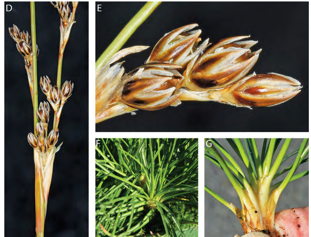
A- habitat, B- whole plants often with dead foliage present, C- whole plant showing flower head, D- flower head, E- capsules and tepals, F- leaves, G- base of leaves.