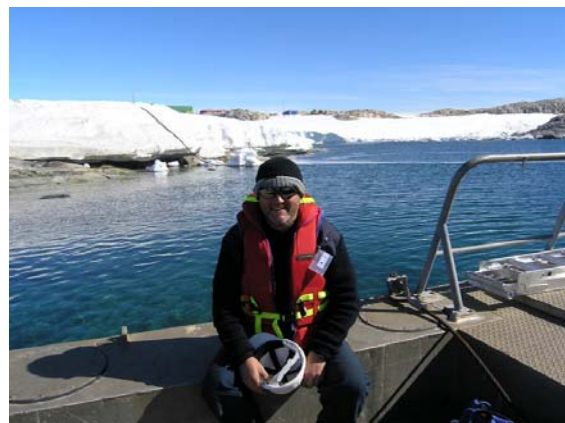
Figure 1. A worker with a PS Badge attached to his chest.

Previous studies of outdoor workers such as [Gies and Wright, 2003] in Queensland showed that the UVR doses received by a worker were significant and often well in excess of the recommended exposure limits. Herlihy et al , 1994 measured the personal UVR exposures for people engaged in outdoor activities and concluded that the subjects received a significant proportion of ambient radiation. [Cockell et al , 2001] measured the exposure of Arctic field scientists to UVR using personal dosimeters. For a typical day of activities under clear sky conditions the dose was near 5.8 SEDs.