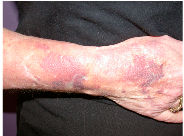
Figure 2. Photoatrophy of the arm.

cytokines such as IL-1, IL-6, vascular endothelial growth factor (VEGF) and THF- \beta .