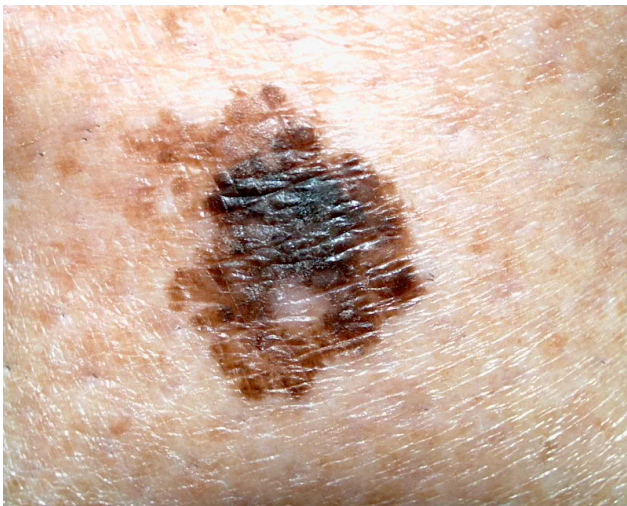
Figure 1. Malignant melanoma.

Abstract. Photoageing is the addition of chronic UV-induced damage to intrinsic chronological ageing. The three main clinical aspects of photoageing are skin cancers (Figure 1), photoatrophy (Fig. 2) and cosmetic concerns. The mechanisms of photoageing include: activation of skin cell surface receptors by reactive oxygen species (ROS), leading to stimulation of stress-associated mitogen-activated protein; ROS mediated damage to membrane lipids leading to ceramide release and generation of prostacyclins; increased transcription of AP-1 and down regulation of TGF- \beta , resulting in loss of collagen; induction of various pro-inflammatory cytokines; damage to mitochondrial DNA, leading to reduced ability to generate energy; damage to dermal proteins; and shortening of telomeres, leading to apoptosis and early senescence.