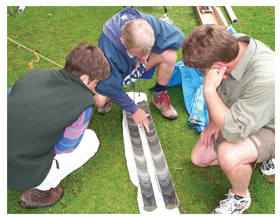
The excitement of a freshly opened core exhibiting its layered history of climatic events.

One feature familiar to lake swimmers is the oozy mud on the bottom. This material is about 30 cm thick, and is a corer's nightmare. The mud slops around in the core tube, mixing layers into an indecipherable soup. This problem was resolved by using an "icebox corer" – a wedge-shaped box filled with dry ice. It is gently lowered into the soft bottom where the dry ice freezes the surrounding sediment. This solidified mass is returned to the surface with the original layering intact.