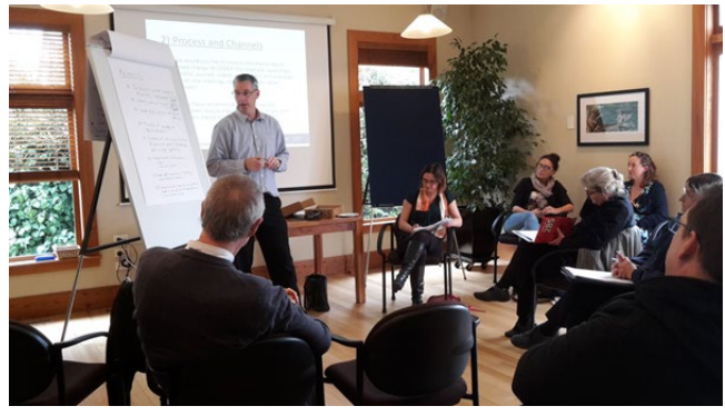
Figure 2: Group discussion at the CCII coastal case study workshop, 29 September 2016.

End-users from government, business, iwi, and communities also participated directly in the project through attendance at community of practice workshops, involvement on the governance group, and one-on-one and group interviews.