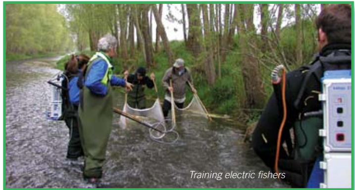
Training electric fishers

Our support of education initiatives is strengthened by association with the Royal Society of New Zealand's Sciences, Mathematics, & Technology Teacher Fellowship scheme. In the 2006 school