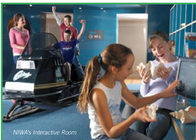
NIWA's Interactive Room

Internally , we have provided educational opportunities for capacity-building in NIWA with awards to 11 staff for technical training in overseas institutions.