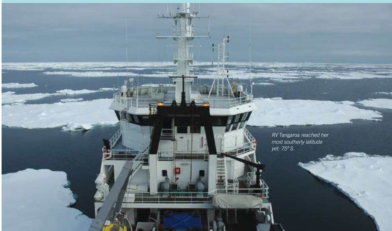
RV Tangaroa reached her most southerly latitude yet: 75° S.