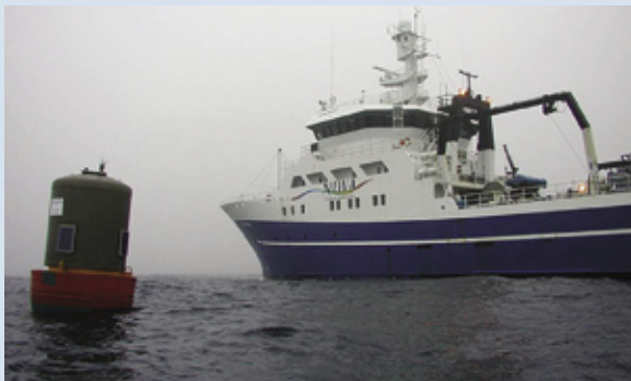
Tangaroa deploys Stanford's buoy.