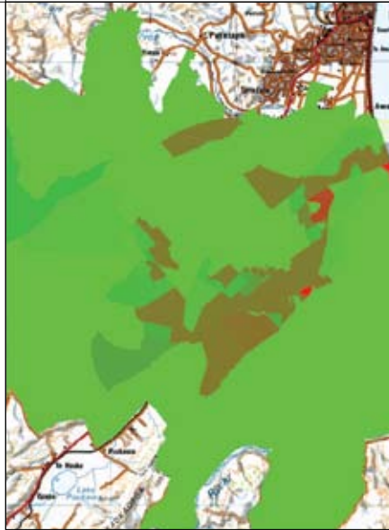
A screenshot from RiskScape showing estimated cost of damage to cars if the stopbank along the Ngaruroro River were to breach during a 1-in-50 year flood. The simulation was supplied by Hawkes Bay Regional Council. The lime green colour shows the extent of the area modelled; cars in these areas would not be damaged. The heaviest damage to cars would be in the red areas. In reality, for this scenario, there would be at least 12 hours' warning, allowing time to shift vehicles.

RiskScape is funded by the Foundation for Research, Science & Technology.