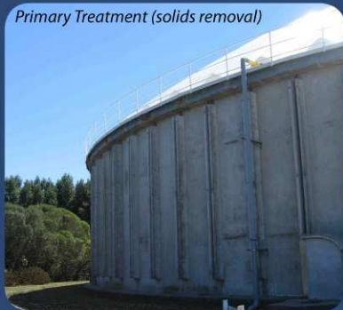
Primary Treatment (solids removal)

Solids are separated from the raw wastewater by primary treatment e.g., gravity settling in a clarifier at Christchurch WWTP.