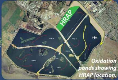
Oxidation ponds showing HRAP location.

Five hectares of the Christchurch wastewater treatment plant (WWTP) oxidation ponds have been converted into the world's first large-scale wastewater treatment high rate algal pond (HRAP) system with CO 2 addition to demonstrate enhanced algal production and tertiary-level treatment. The system of four 1.25 ha HRAP treats 2000 m 3 per day of primary effluent from the WWTP and scrubs CO 2 from up to 500 m 3 per hour of exhaust gas from the treatment plant biogas driven electricity generators. Algae is harvested from the HRAP effluent by simple gravity settling for conversion to bio-crude oil by Solray Energy.