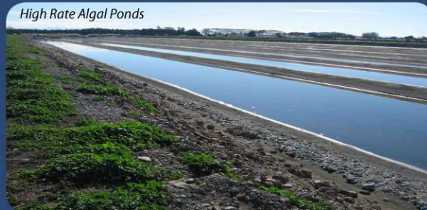
High Rate Algal Ponds

HRAP are shallow, gently mixed, raceway ponds which promote algal photosynthesis. The gentle mixing exposes wastewater to sunlight (for algal growth) and solar-UV (for natural disinfection). HRAP are particularly useful for wastewater treatment because they provide more efficient nutrient removal and disinfection than oxidation ponds, and are much more cost-effective than energy intensive mechanical wastewater treatment systems.